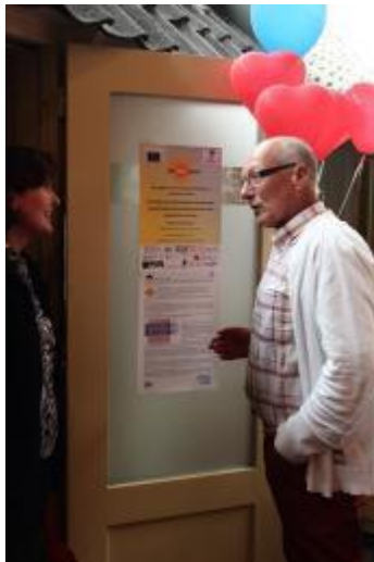
The Netherlands - congress