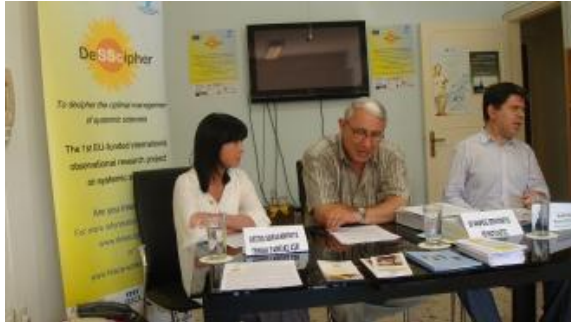
Cyprus – press conference

In some countries the Project was introduced by successful press conference (Cyprus, Finland).