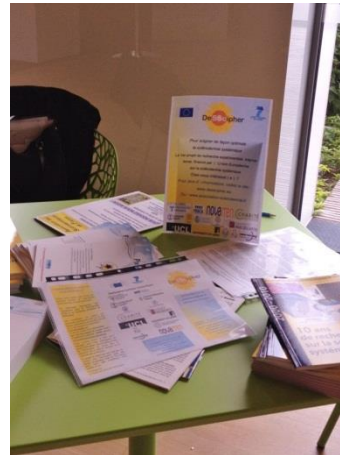
France - congress materials